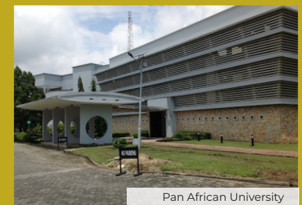
Pan African University