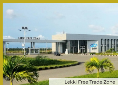
Lekki Free Trade Zone