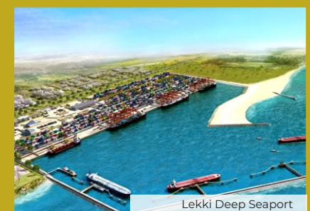
Lekki Deep Seaport