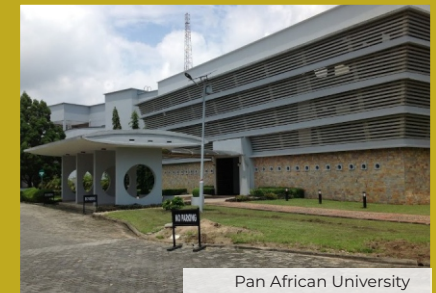
Pan African University