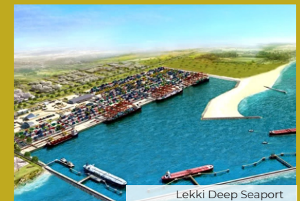
Lekki Deep Seaport