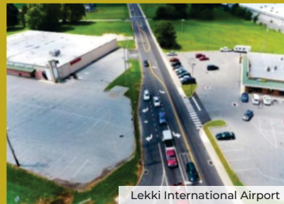
Lekki International Airport

With these, you are located at one of the most rapidly developing business hubs in West Africa.