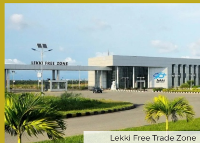
Lekki Free Trade Zone