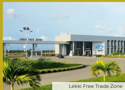
Lekki Free Trade Zone