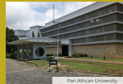
Pan African University