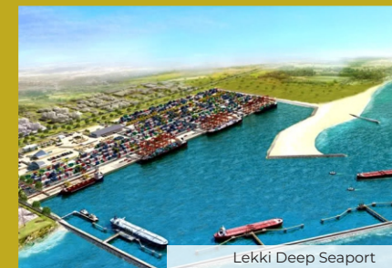
Lekki Deep Seaport