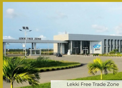
Lekki Free Trade Zone