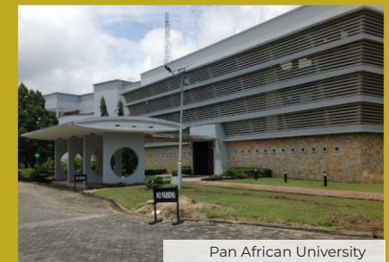
Pan African University